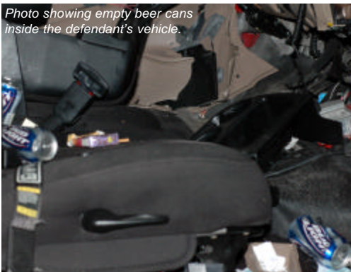
Photo showing empty beer cans inside the defendant's vehicle.

minors and abysmal hiring and training practices.