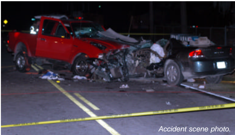
Accident scene photo.